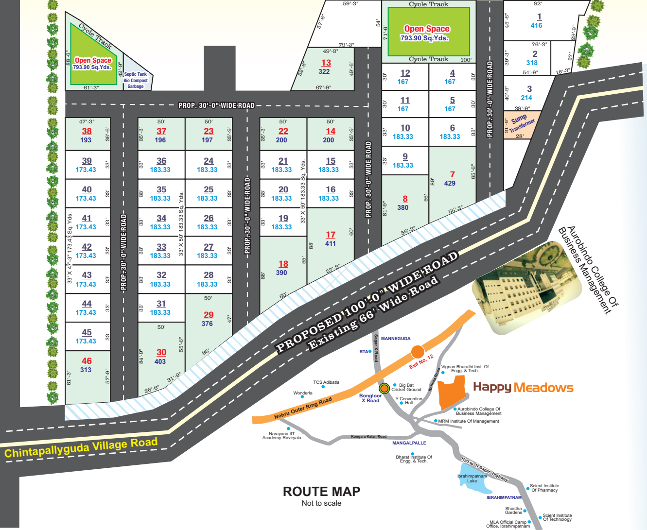
ROUTE MAP Not to scale